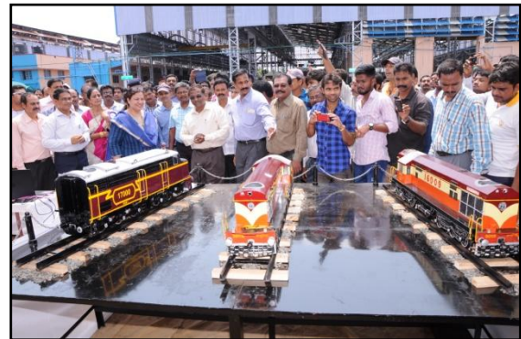
Inauguration of Loco Model Stall

Various prizes were distributed to the winners of the sports events, conducted, to mark the Golden Jubilee Celebrations.