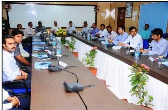
Delegates at the HHP Technical Seminar

experiences in maintaining the HHP locomotives.