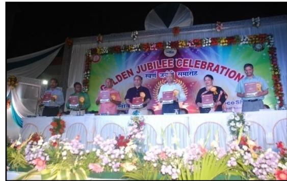
Release of Souvenir

It was hugely cheered by the audience. The Chief Guest also released a Souvenir, in the memory of Golden Jubilee Celebrations.