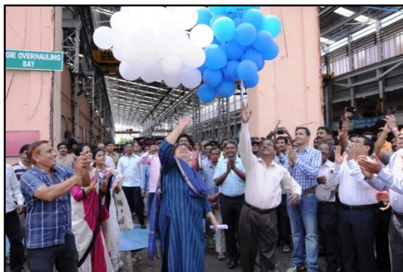
Releasing of Balloons by the DRM & CMPE to mark the inauguration of celebrations.

The inauguration was marked by releasing of balloons and pigeons and inauguration of the art gallery.