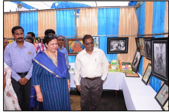
Inauguration of Art Gallery

The art gallery contained various sketches, paintings and crafts done by the shed staff.