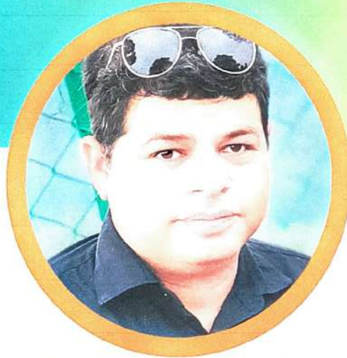
RK DOHARE SMM-I/HQ/ECOR